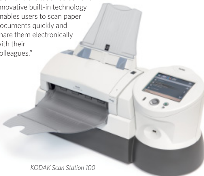
KODAK Scan Station 100

"The new Scan Station 100 is unique in the marketplace".